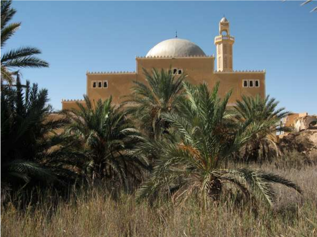
Tijani Zawiya of Tamacine